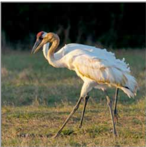
Whooping Cranes

Our board has met four times with the consultant that we engaged to assist us in planning. Lots of ideas were discussed. Priorities were chosen. The final draft will happen sometime in October. We'll keep you posted.