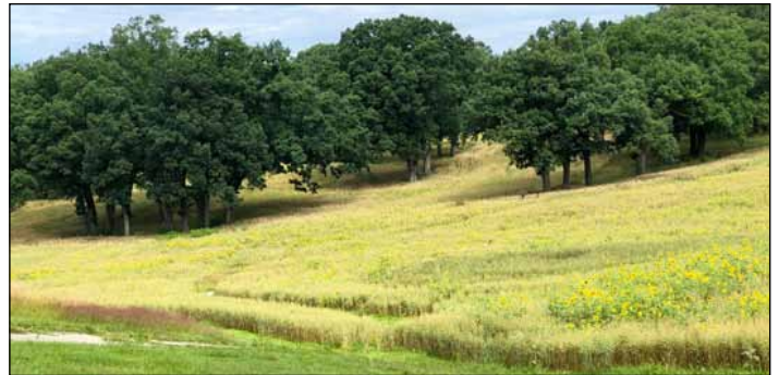
Three Waters Reserve, N3941 Golf Course Rd, Brodhead, WI